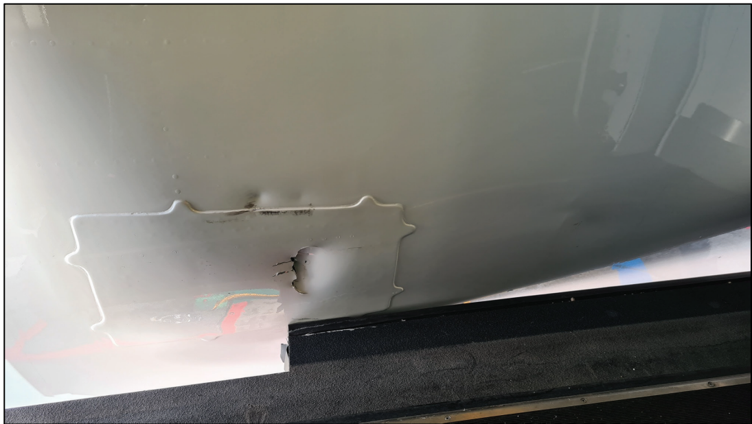
Photo 2. Damage to the aircraft fuselage skin.

The structural damage to the aircraft fuselage skin prevented the aircraft from being pressurized.